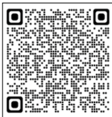
Police Scotland - Little Book of Big Scams